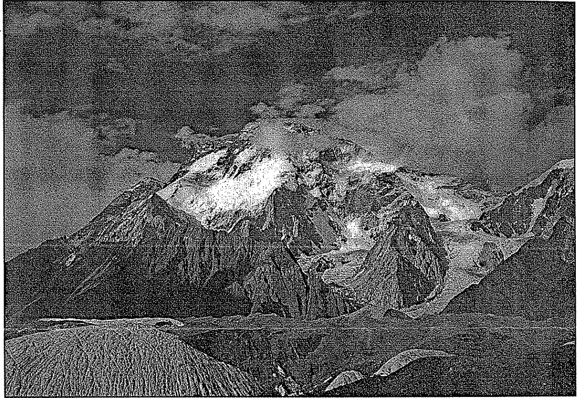
Broad Peak, Pakistan. Successfully climbed by Irish K2 Expedition 1998

The magazine of the An Óige Hillwalkers Club