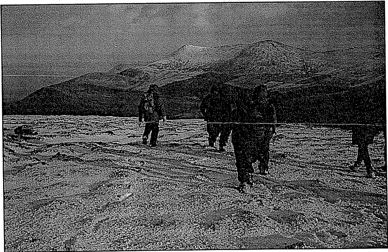
Winter on the Iveragh Peninsula

Sunday Hikes Young Hillwalker's Club Weekends Away Holidays Away Special Interest Hikes Club Travel