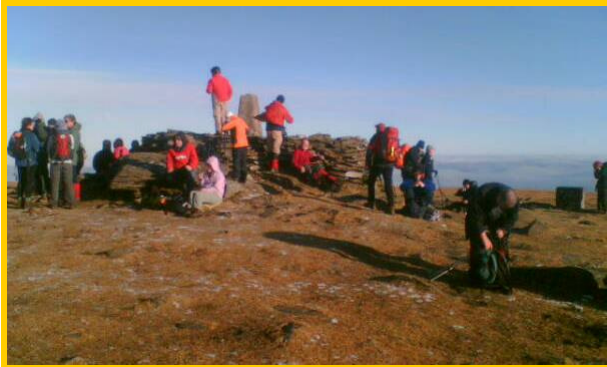
Lunch on top of Lugnaquilla.

W hat a day for a hike! A lucky 13 turned up and were well rewarded.