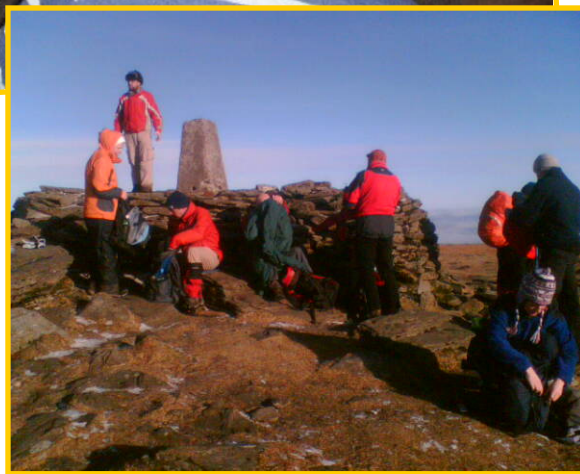
Right: Lugnaquilla on New Year's Day (Leo Oman)