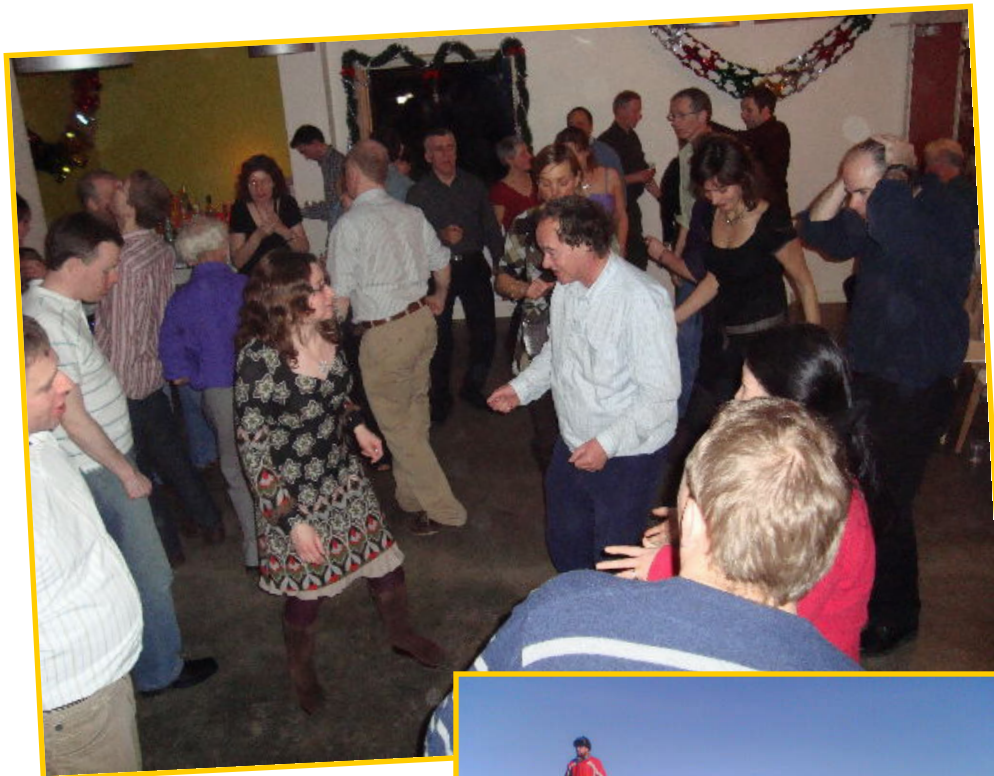
Hillwalkers enjoying the Christmas break